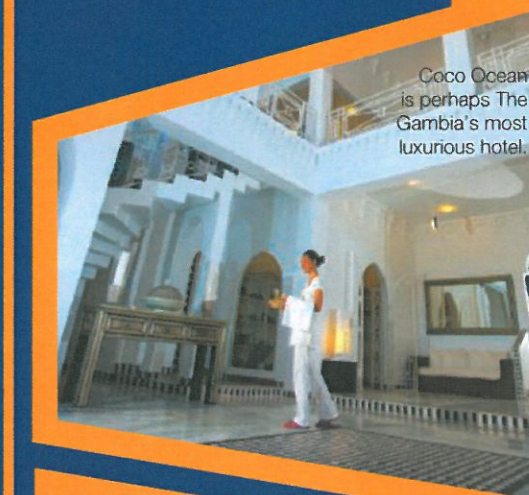
Coco Ocean is perhaps The Gambia's most luxurious hotel.

Special offers are available at gambia.co.uk/specialoffers and more information on excursions at gambia.co.uk/excursions