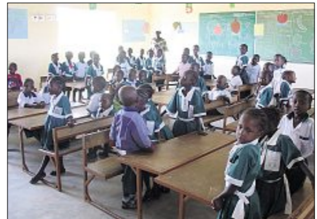
■ LEARNING CURVE: Pupils at Mansa-Colley Bojang Nursery