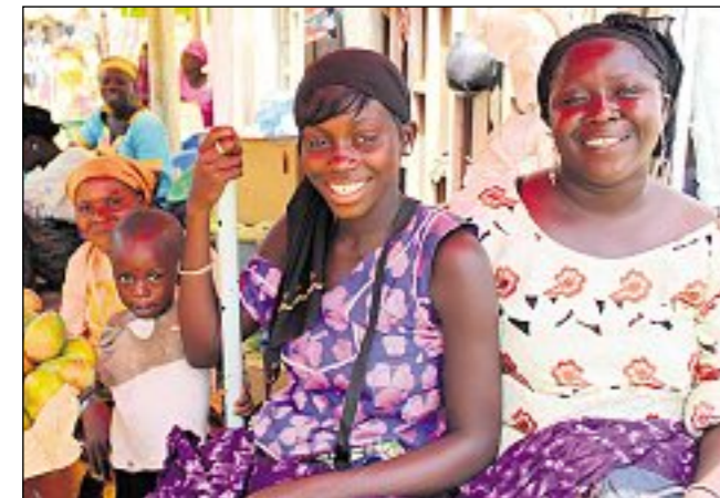
■ HAPPY FACES: The Gambia lives up to its 'Smiling Coast' tag

2 MADRID & CENTRAL SPAIN: Travel Dept (020 7099 9665) offers five nights' half-board from £439 from February 21. Highlights, incl guided city tour of Unesco World Heritage Site of Toledo, full day in Madrid and full day at Unesco World Heritage Site of Avila with return flights ex-Edinburgh to Madrid and five nights' half-board at four-star Hotel Alfonso VI.