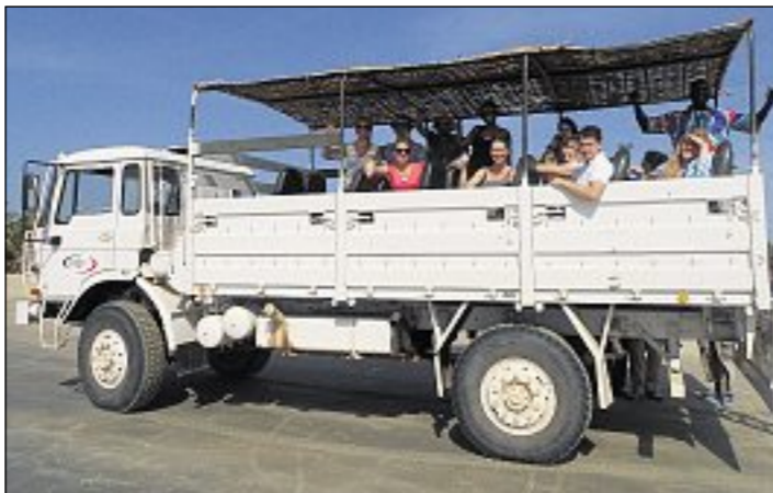
■ KEEP ON TRUCKING: Tourists pile in to a passenger carrying lorry