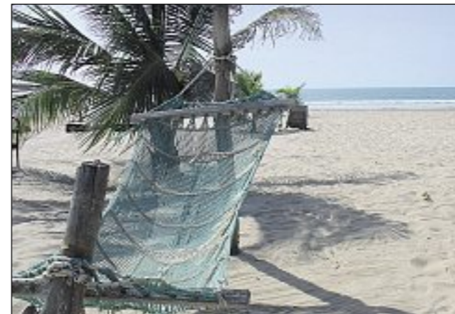
■ GOLDEN DELICIOUS: A hammock sways on a deserted beach