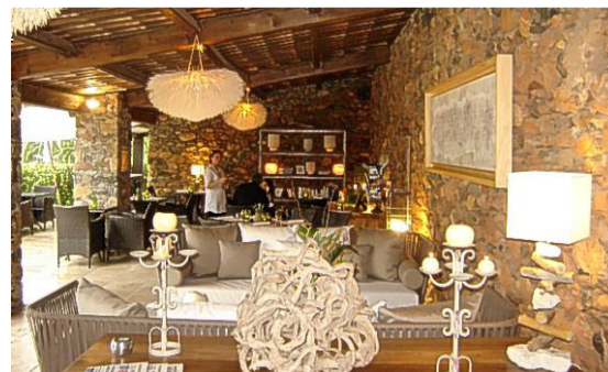
Taking in the views from the balcony at Capo Rosso Hotel in the Golfe de Porto, top; inside the tranquil five-star hotel La Dimora, built around a former farmhouse.