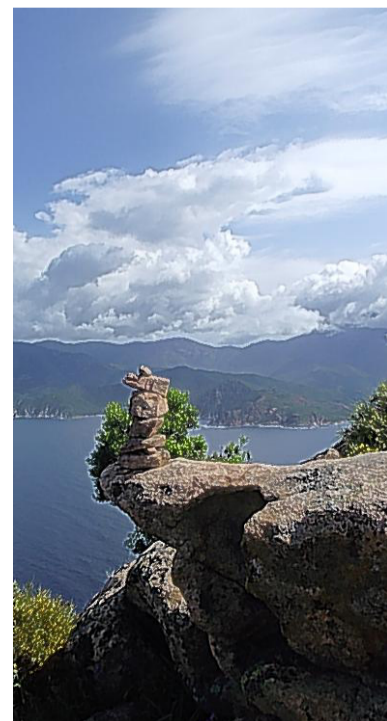
There is plenty to explore inland on Corsica, including the village of Sant'Antonino, perched on a densely forested hilltop, main picture; above left, Cap Corse in the north of Corsica and, right, the Calanches on the Golfe de Porto

'From pristine white sand beaches to dramatic cliffs plunging into azure blue seas, Corsica lives up to its name of Ile de Beaute – the beautiful island'